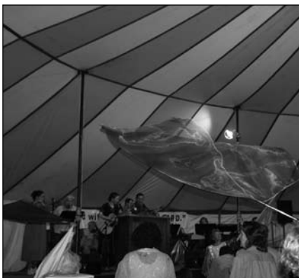
The praise and worship was glorious!

around and around until the unbelieving complainers died off. The decisions we make in this place will affect our entire future! The firstfruits go to the pioneers who will obey God and go where and when He says go.