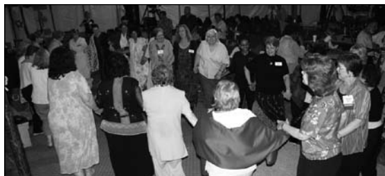
The Glory Dance Finale

When we prayed through at the altar following that message, a dance of glory and rejoicing broke out and filled us all with joy for the journey into obedience to the Lord for the days to come!